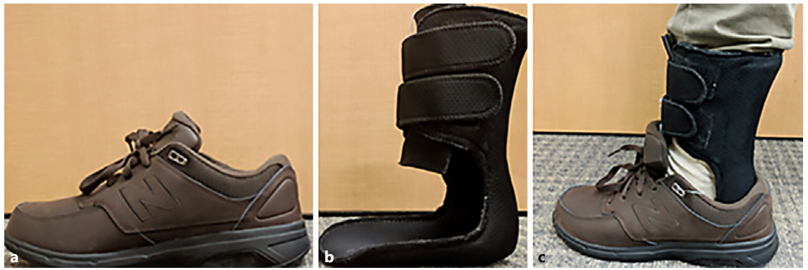
Fig. 1. Illustrations of the footwear provided to the participants. a New Balance shoe. b AFO. c AFO and New Balance shoe worn by a typical participant in the IG.